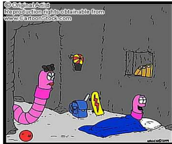
You know what they say Mum: The early bird catches the worm! So I'm sleeping in...