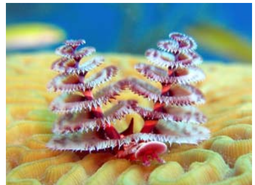
Christmas tree worms, or Spirobranchus giganteus