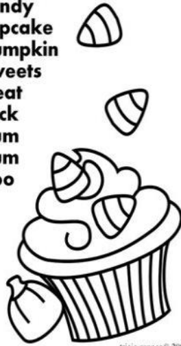
tricia-rennea © 2008

October is here, meaning Halloween is upon us once again. When October 31st is over, don't forget to vermicompost your pumpkins—worms love to eat pumpkins! But remember, your worms are not fans of sweets... So no feeding the worms candy!